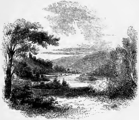
View of the first settlement in Van Diemen's Land.

Land, and assisted in the early colonization of the sister island.